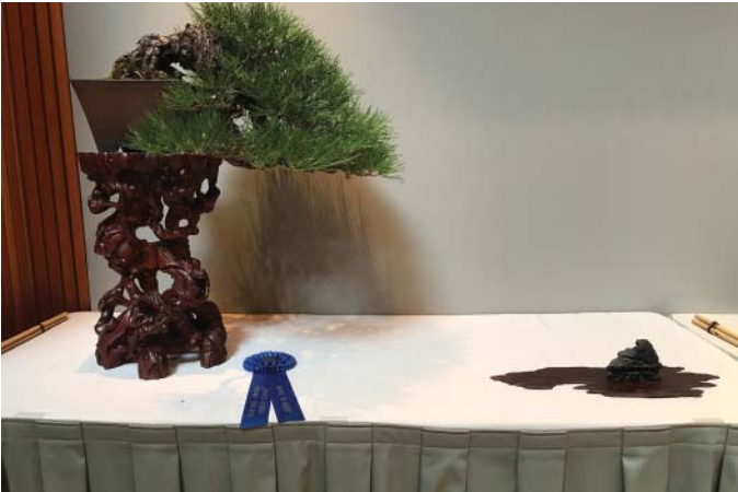
Gary Andes' Japanese Black Pine - Award of Merit