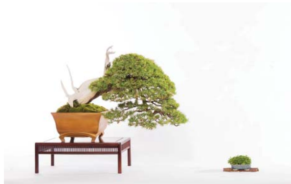
Matt Berenberg's Needle Juniper - Award of Merit