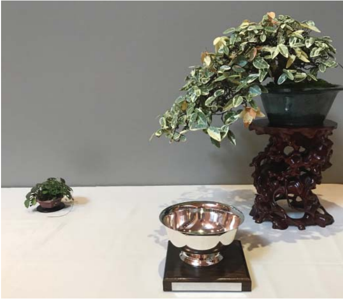
Midwest Bonsai Connection