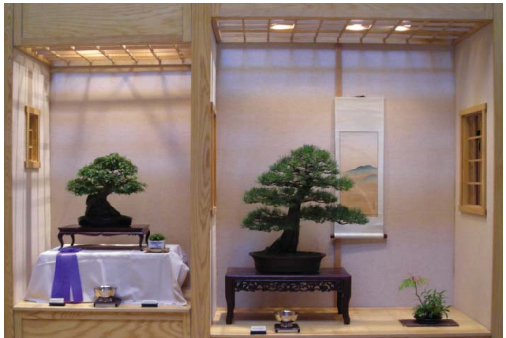
Best of Show and 1st Place Professional Award winning trees, displayed side by side