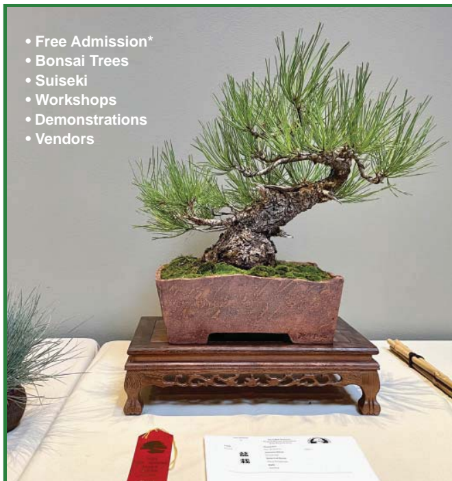
© 2021 Ponderosa Pine, Ron McAdams, Photo by Jen Fonseca