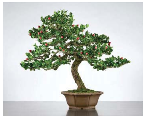
© 2013 Chicago Botanic Garden. Photo by: Tim Priest M. Photog., Cr